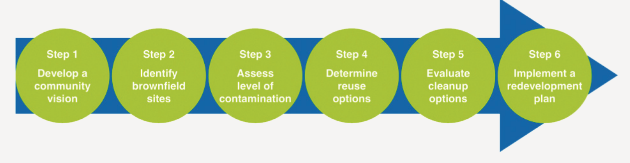
Figure adapted from "Reuse: Creating community-based brownfield redevelopment strategies." 10

As noted in Section III of this report, area-wide plans are distinguished from related land use plans by their commitment to identifying and remediating key sites. The figure below lays out the relationship between planning and clean-up milestones, showing how brownfield identification and cleanup activities fit into the process of developing a community vision (Step 1) and implementing plans (Step 6).